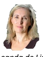
Leanda de Lisle